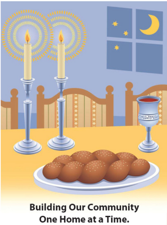
Building Our Community One Home at a Time.